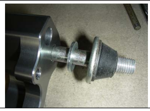
450: install the 2mm washers between the cone and bottom of the sub mount