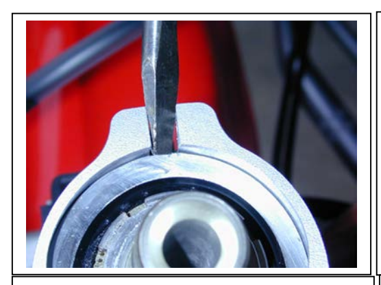
Spread the bracket gently, only enough to allow it to slide over the head tube.