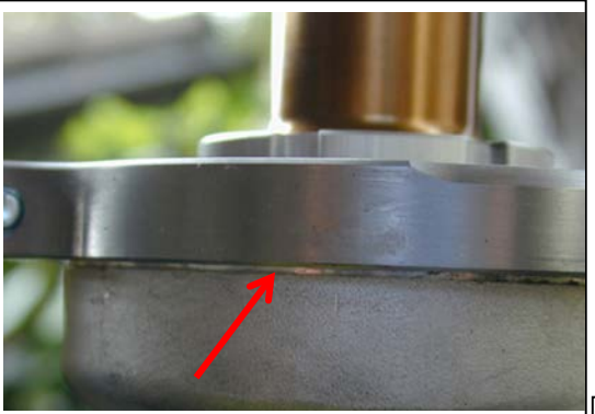
The machined area showing below the bracket should be equally spaced to be sure it's flush.