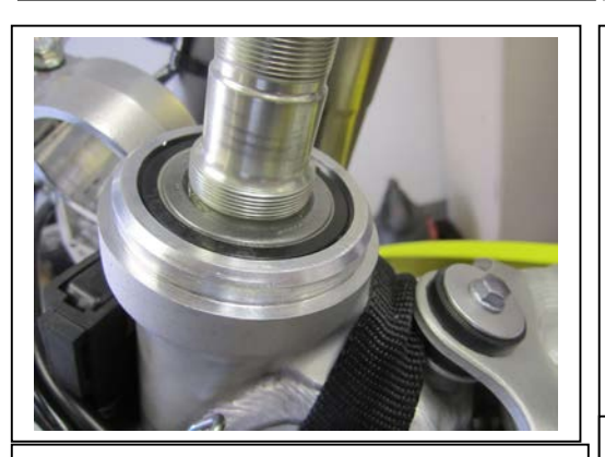
This shows the dust cover removed.