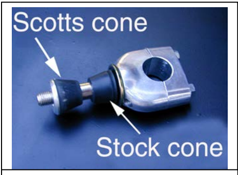
This shows the stock mounting perch