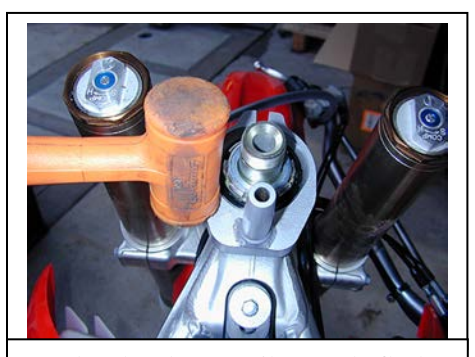
Tap bracket down until securely flush