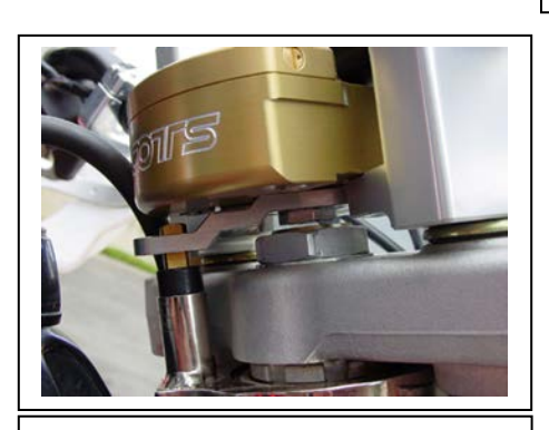
Shows correct tower pin height