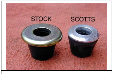
Use our replacement cone on the bottom