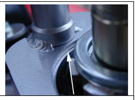
Be sure the frame bracket is <u>all the</u> <u>way down</u> flush with the head tube, all the way around the entire surface.