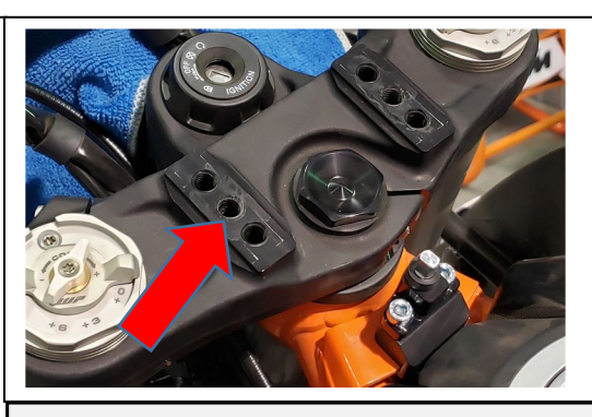
Install the tower pin with grease on the shaft. Remove the stock lower handlebar perches. Use the center hole for installing baseplate