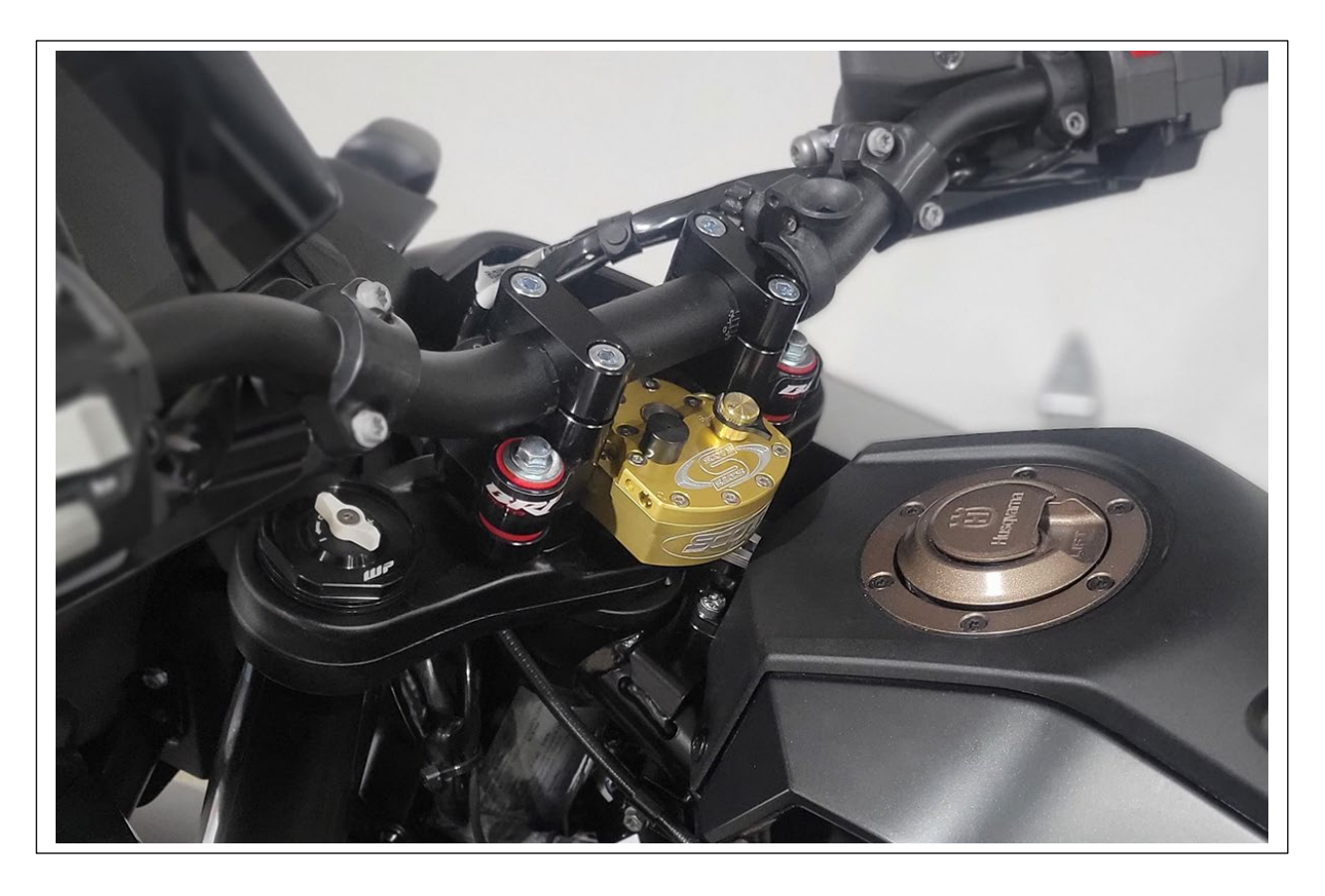
Ktm 790 /890 & R Adventure & 901 Norden instructions.doc SUB-3550-01R

Above shows the finished shroud cut to fit around the frame bracket tower and link arm. Below shows the finished kit, installed properly and tucked into nicely to the frame.