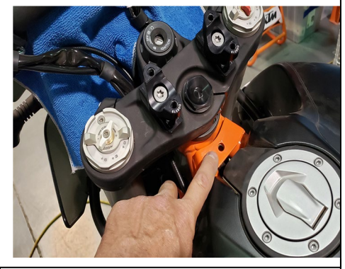
Remove the bars and lay forward in a towel. Remove the frame plug to uncover the 8mm hole.