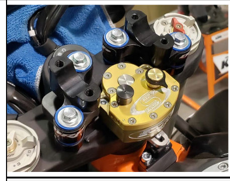
Install the new lower handlebar perches as per the separate instructions for this step.