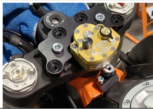
Install the stabilizer making sure the tower pin is aligned as you see in the picture.