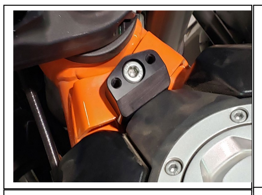
Bolt the lower half of the frame bracket to the 8mm hole in front of the tank