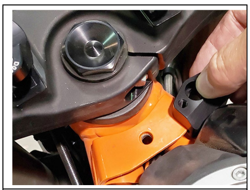
Slide the base plate onto the frame matching up the 8mm hole