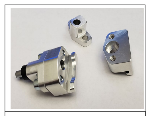
Right: shows both frame bracket parts. Left: shows the assembled frame bracket. Parts are silver to help show you detail.