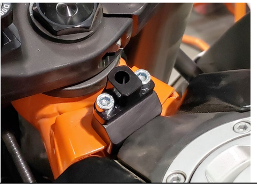
Bolt the upper half of bracket to lower half using 6x20 bolts provided