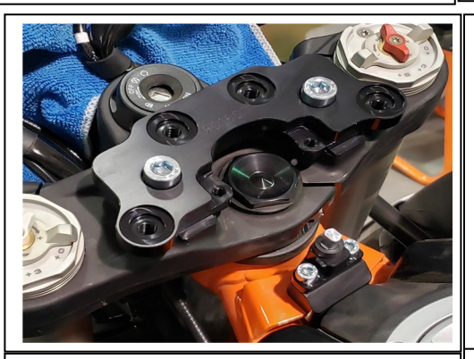
Install the SUB mount base plate to the middle set of holes in your triple clamp