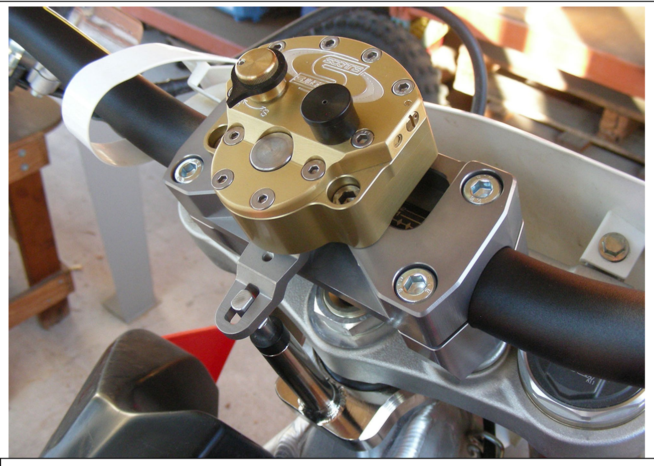
Finished kit installed using the stock oversized handlebars