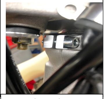
Be sure the new lower cone clears the frame bracket at full lock on the underside of the triple clamp.