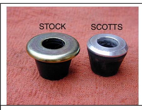
Use our replacement cones on the bottom