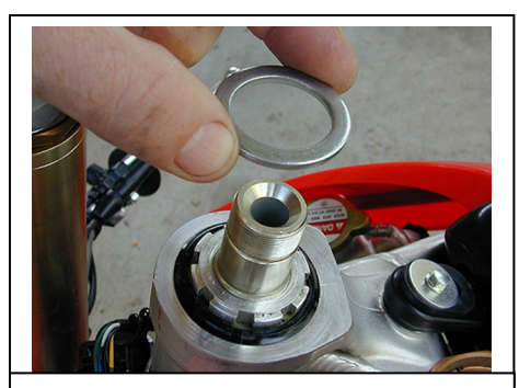
Install the provided aluminum spacer/ washer with the chamfer side facing downward. This is very important as it gives the clearance required.