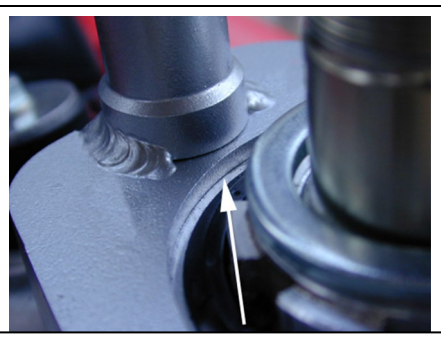
Be sure the frame bracket is <u>all the</u> <u>way down</u> flush with the head tube, all the way around the entire surface.

This shows the stock mounting perch assembly order, stock cone above, Scott's cone on the bottom.