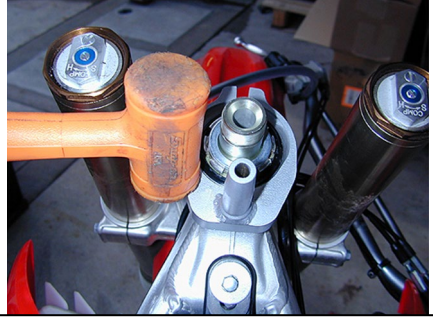
Tap bracket down until securely flush